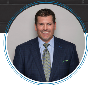
Denver Broncos Legend