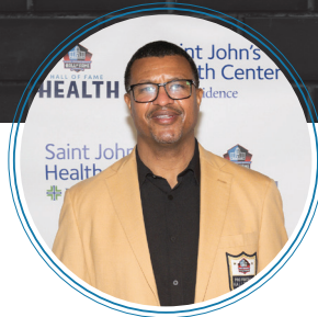
Pro Football Hall of Famer