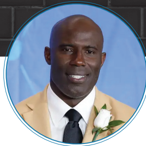
Pro Football Hall of Famer