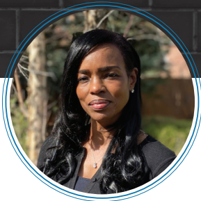
Fund Recovery Board Member (MS, LPC, LAC, MFTC, RPT, CSST, CSAT)